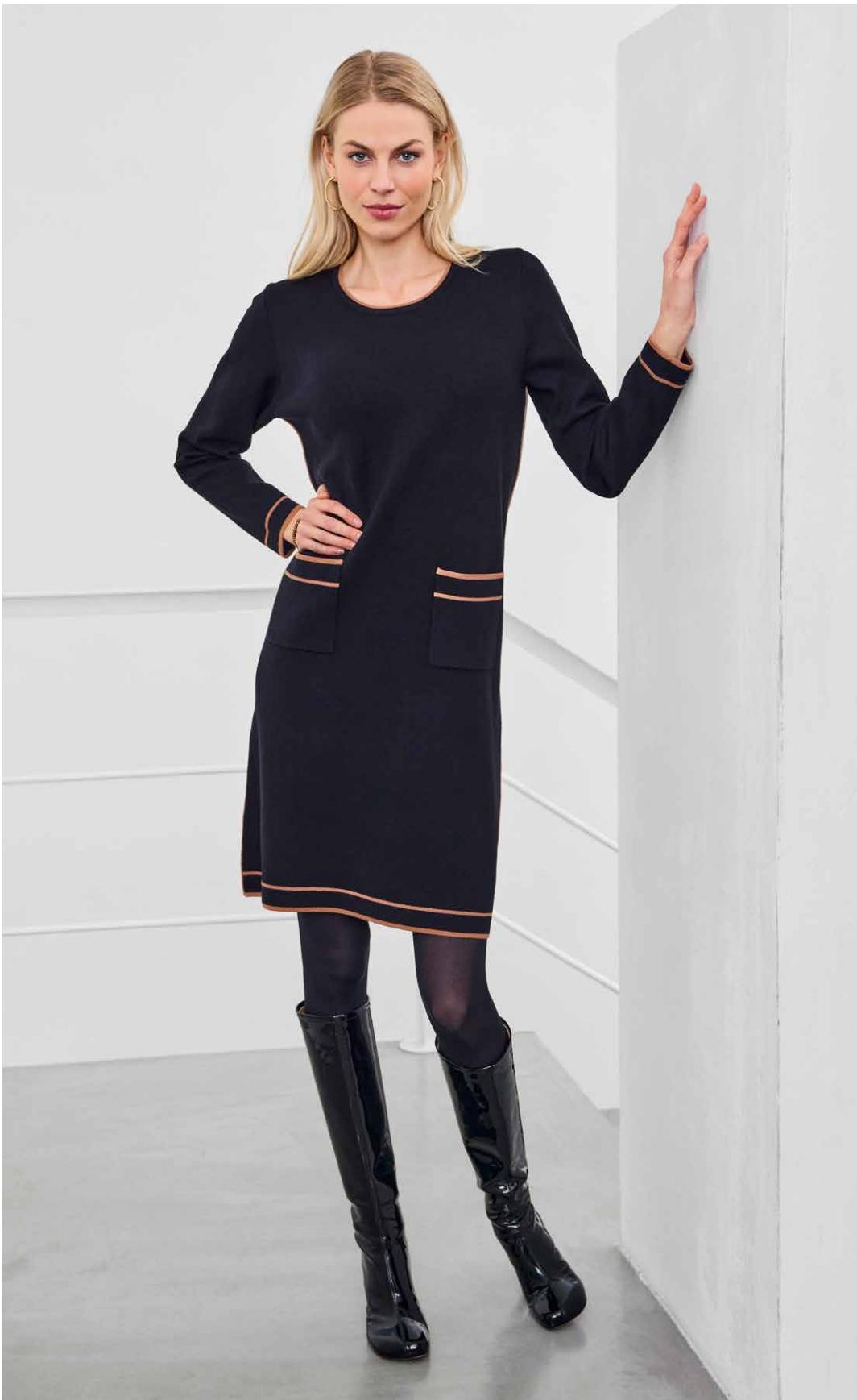
Winter Milano Knit