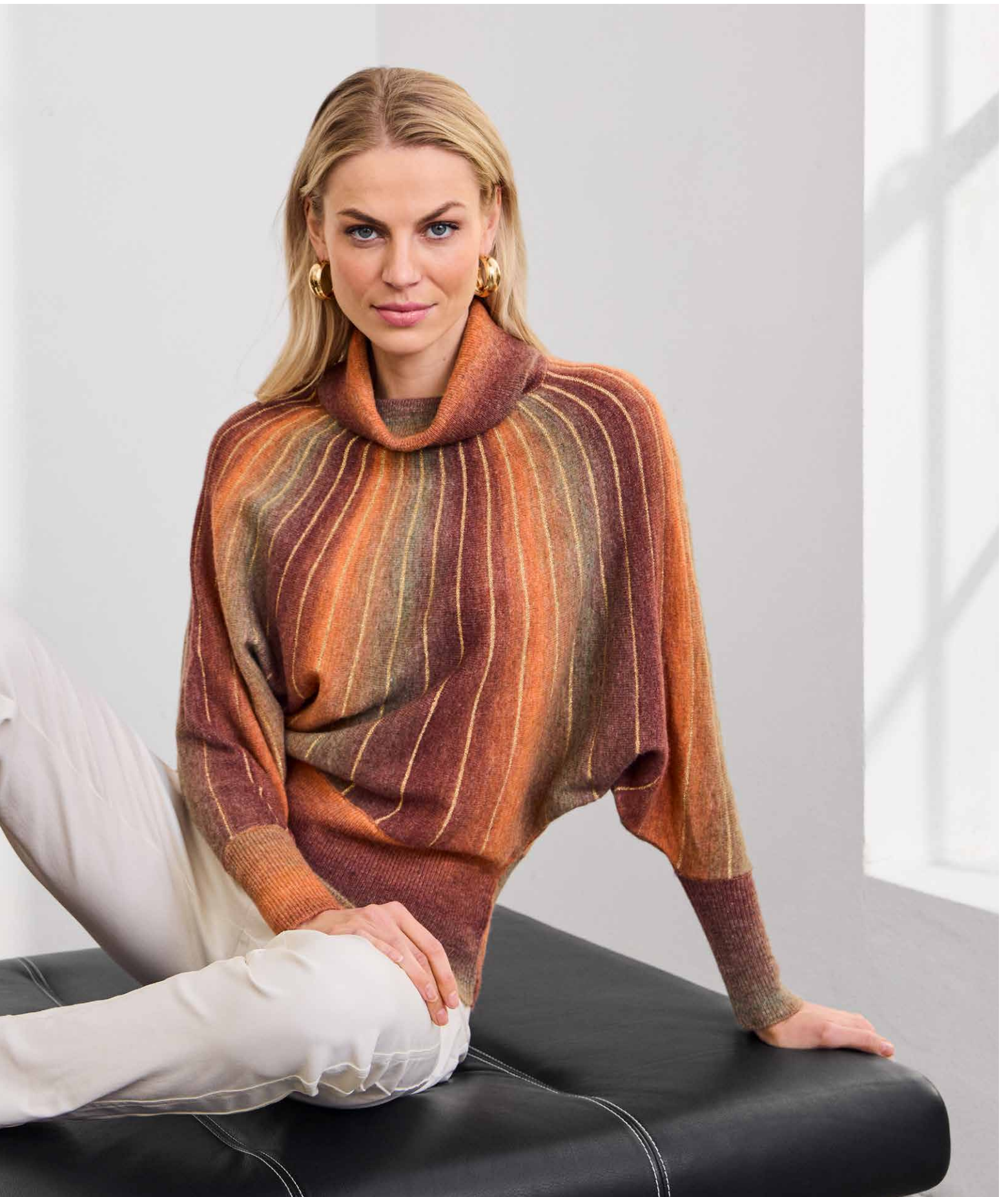
Bat Wing Sleeve Knit Soft Coated Pants