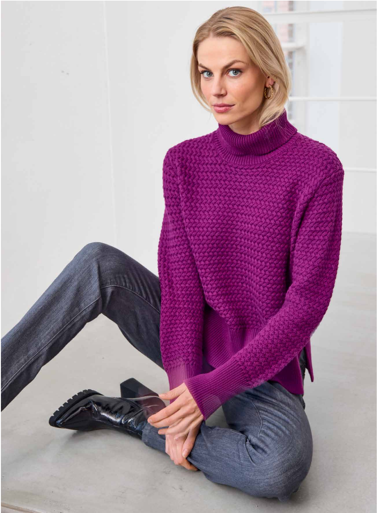
Organic Cotton Basket Knit 179-164 Easy Denim 120-840