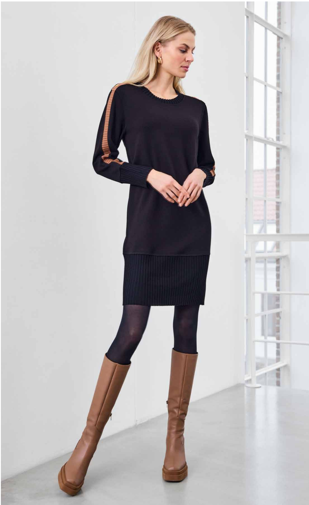
Sporty Winter Look