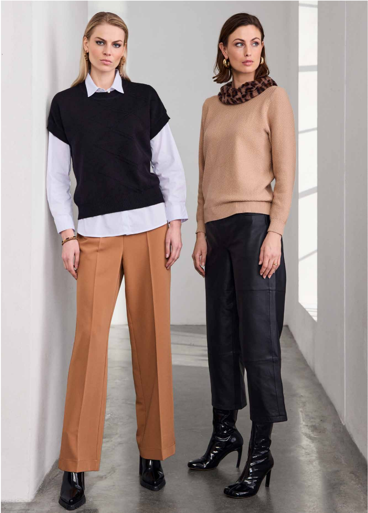
Basic Cosy Knit 179-178 Shirt 143-215 Autumn Business Program 121-855