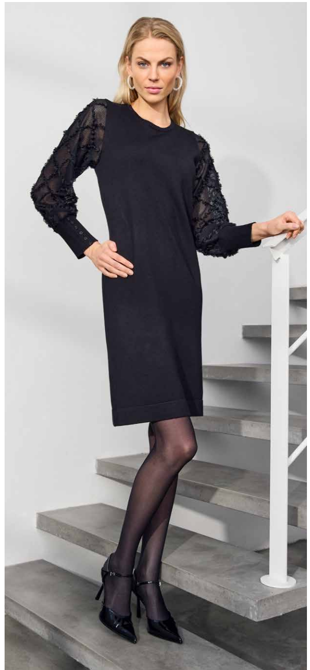
Fancy Lace And Knit 115-916