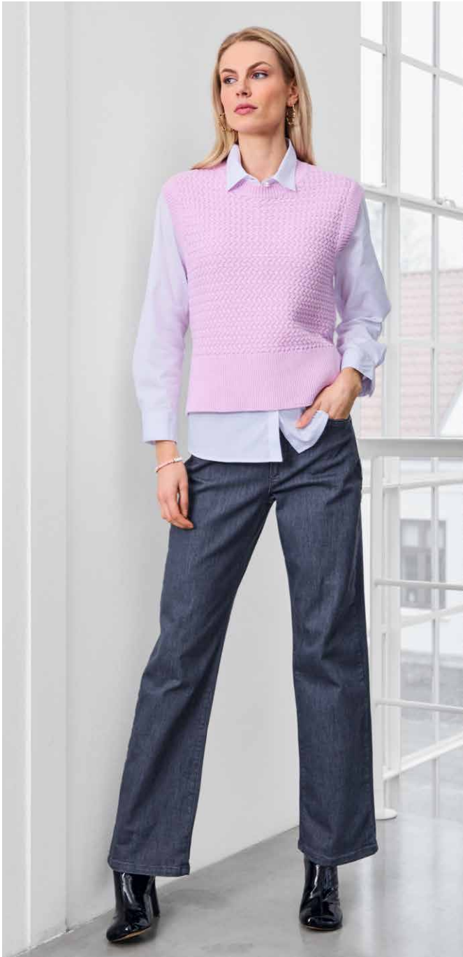
Organic Cotton Basket Knit 112-465 Shirt 143-215 Easy Denim 121-835