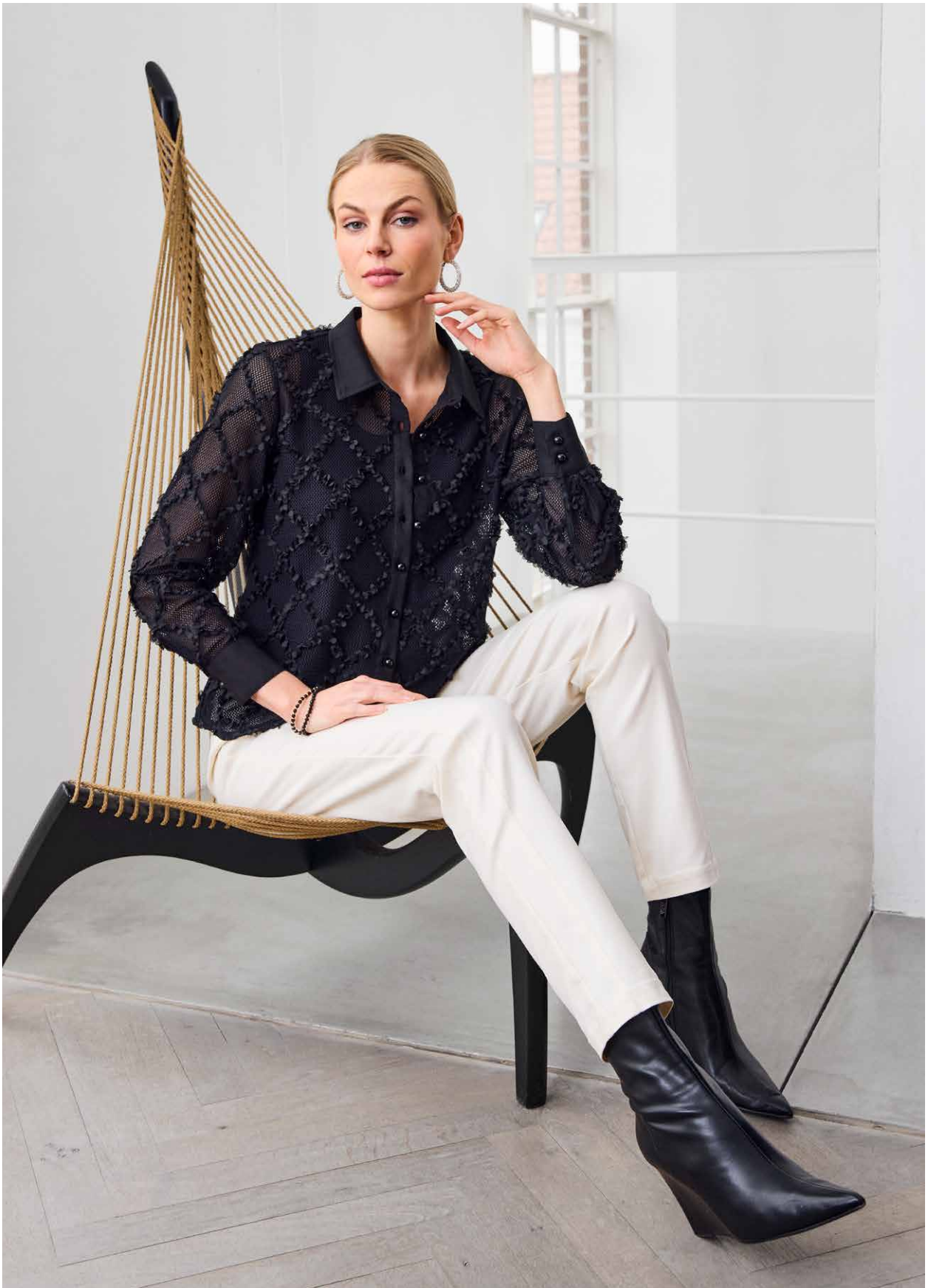
Fancy Lace And Knit 143-220 Basic Fine Rib T-Shirt 112-462 Soft Coated Pants 121-851