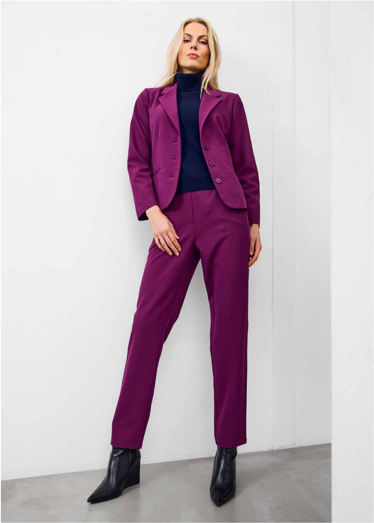
Autumn Business Program 141-248 Elaine Cashmere 167-162 Autumn Business Program 120-894