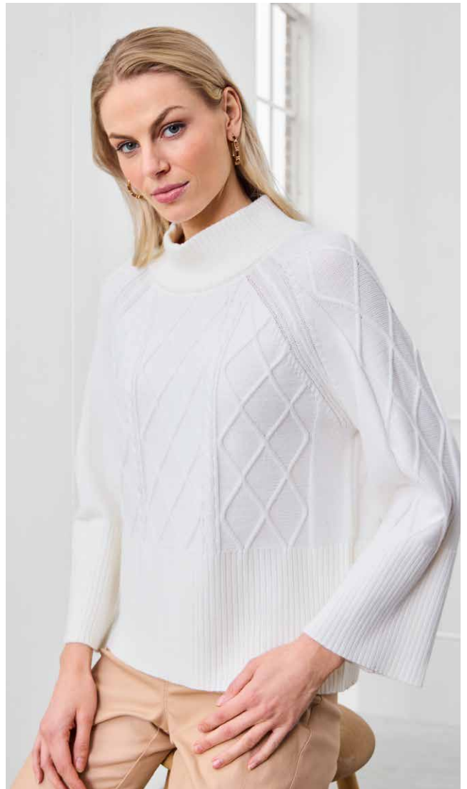
Comfy Knit 180-102 Soft Coated Pants 121-852