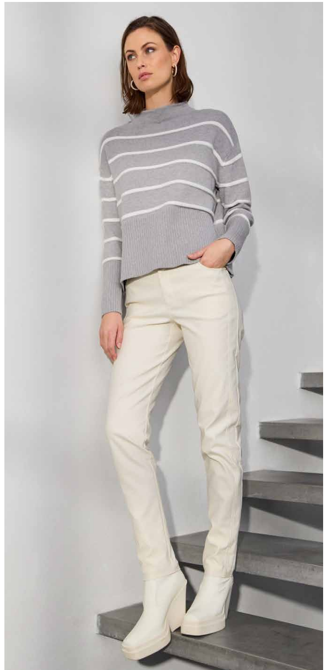
Comfy Knit 179-193 Soft Coated Pants 121-851