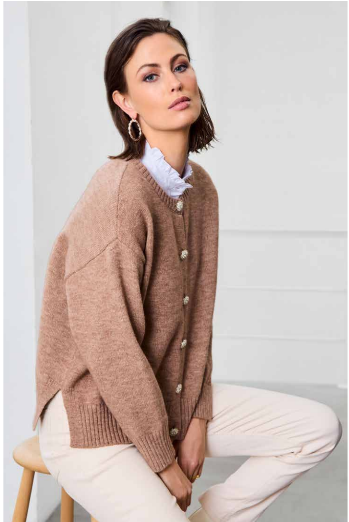
Basic Cosy Detail Knit 143-250 Shirt 104-584 Soft Coated Pants 121-851