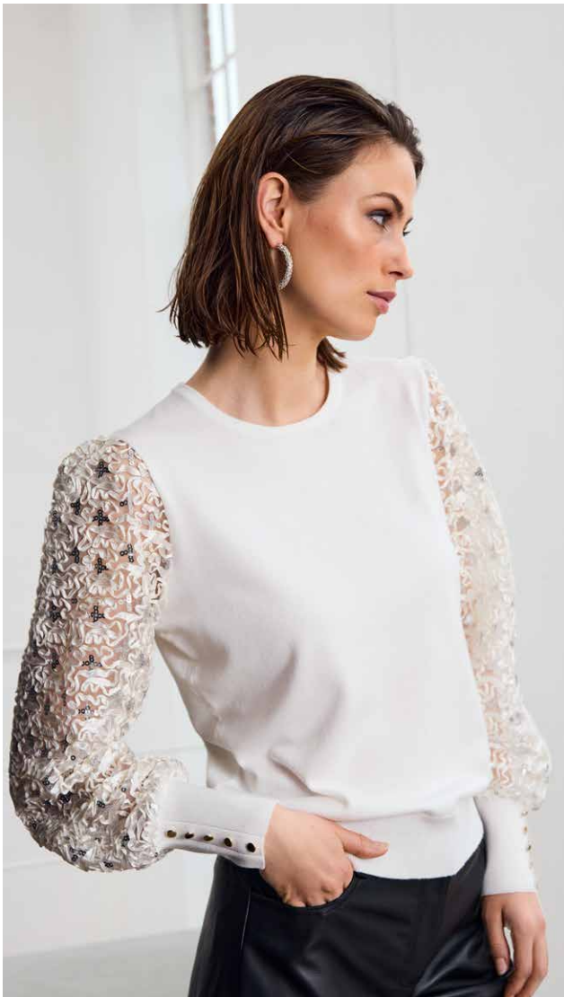
Sequin Lace And Knit 179-139 Leather 121-850