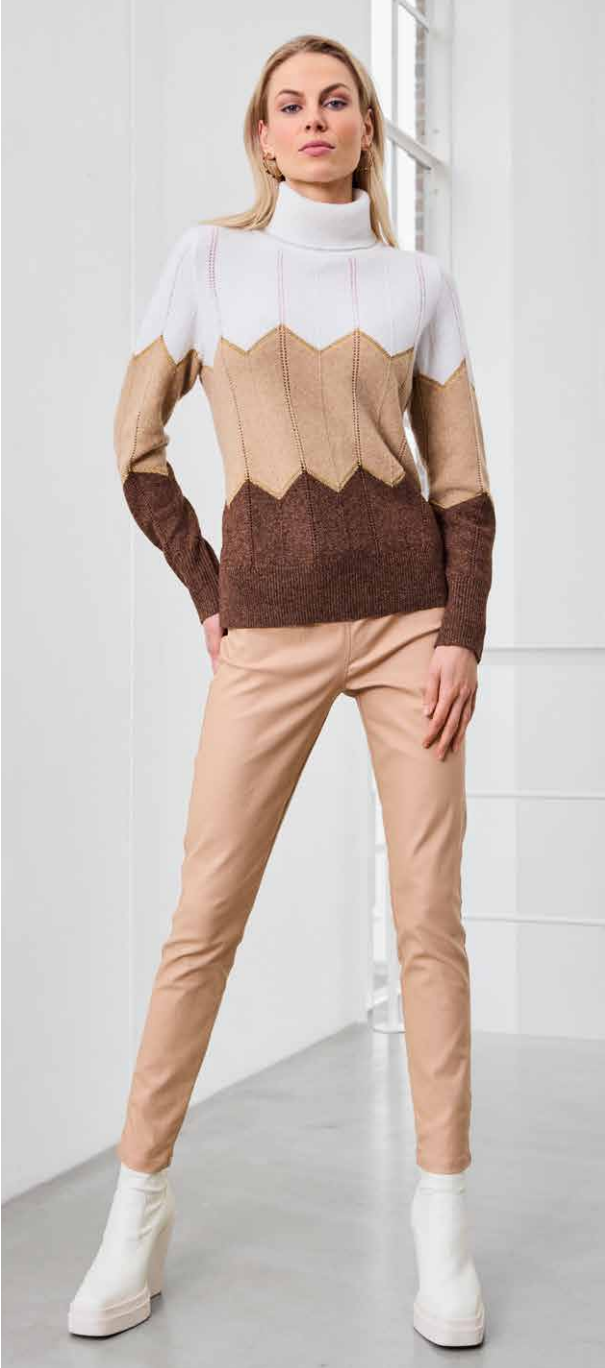
Knit With Lurex Effect 179-191 Soft Coated Pants 121-852