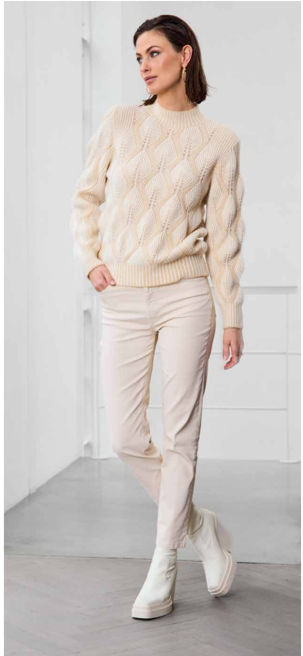
Leaf Structure Knit 179-157 Soft Coated Pants 121-851