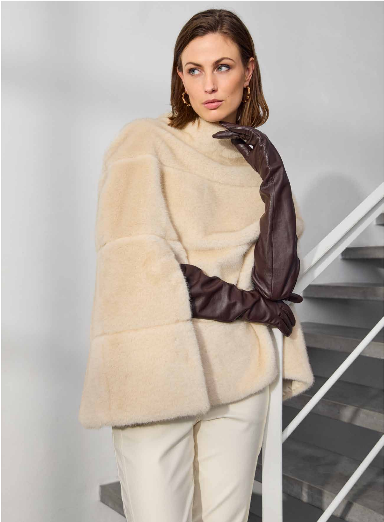
Fur Coat 104-582 Soft Coated Pants 121-851