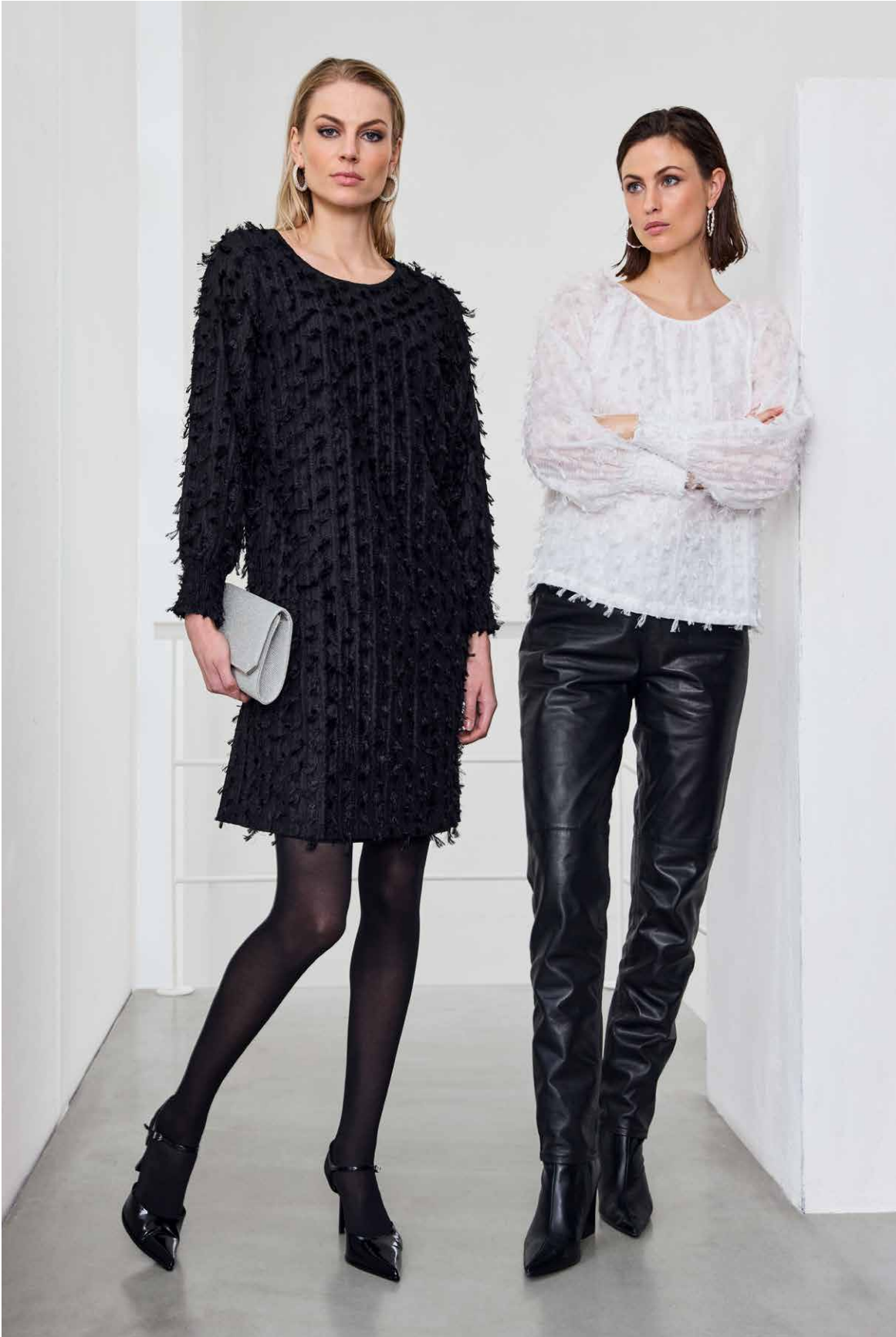
Fringe Fabric 115-930